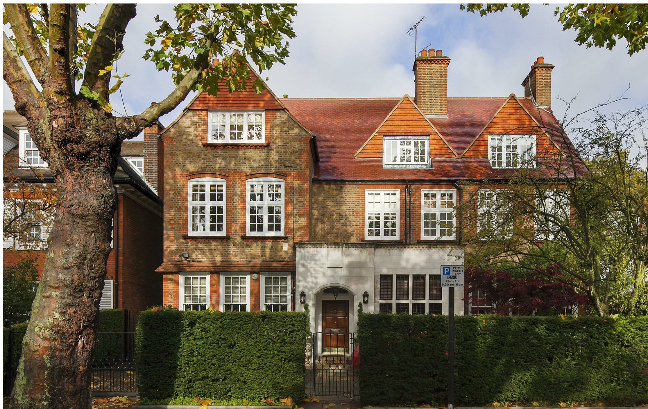
1,19 Wadham Gardens, London NW3 3DN Asking price £7,100,000 Leasehold